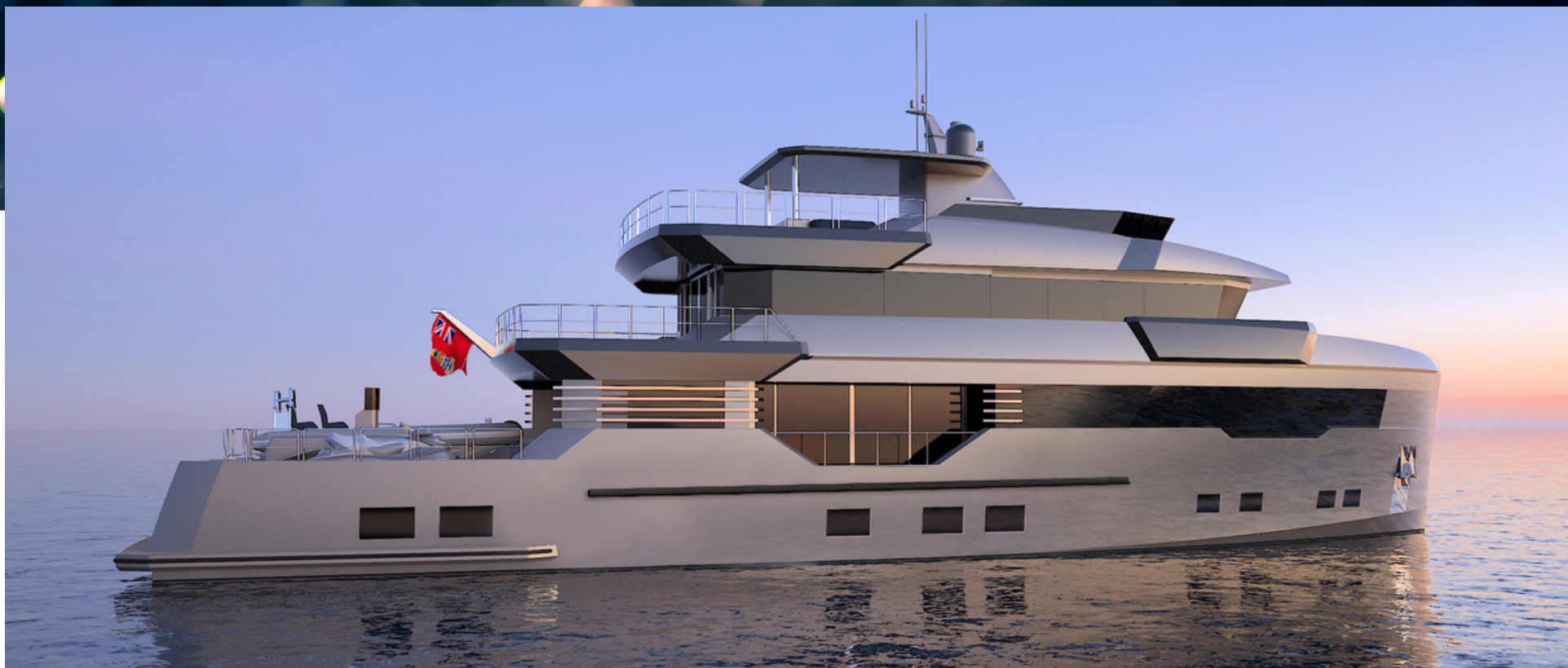
REALE PACIFICO 32