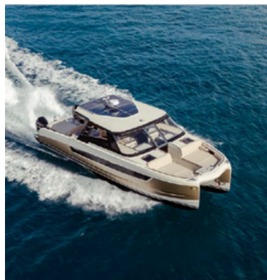
YOT POWER CATAMARAN